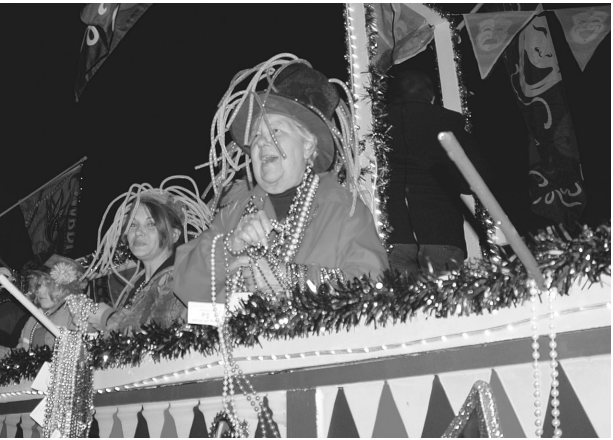
Board members were joined by family and friends on the Main Street Milton float.

At 6 p.m. the procession headed south on Stewart Street amid throngs of people shouting for beads. Children jumped with excitement